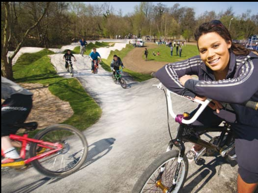
Shanaze Reade, twice BMX World Champion, at the Colshaw Farm BMX Track which she opened in April 2010.